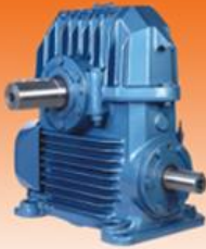
REDUCTION GEAR MOTOR

Our products are high in demand due to their premium quality, seamless finish, different patterns and affordable prices. Furthermore, we ensure to timely deliver these products to our clients through this, we have gained a huge client base in the market.