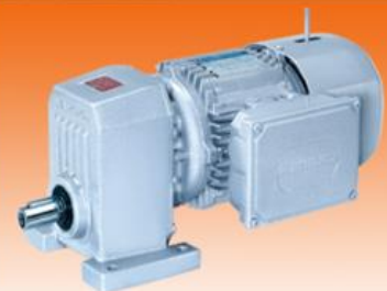
WORM REDUCTION GEAR BOX

Being counted amongst the leading manufacturers and suppliers of the commendable Hydraulic Tube Bending Machine, we never compromise with its quality.