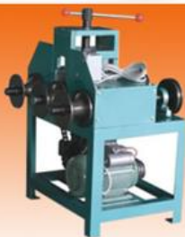
PIPE BENDING MACHINE

We are rendering Tube Bending Services to our patrons. Due to prompt completion, our offered service is extremely admired in the market. Our service meets on client's demand. Moreover, we render this service as per patron's demand.