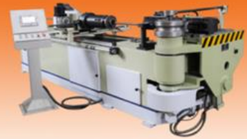
TUBE BENDING MACHINE

Owing to our principled business strategies and understanding of this business arena, we are immensely involved in providing Gearboxes Maintenance Service.