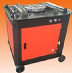
HYDRAULIC TUBE BENDING

We are providing the services of Pipe Bending. We have latest technology equipment for metal sheet bending to perform accuracy in our work. We are rendering a wide range of Bending Machine Service to our customers.